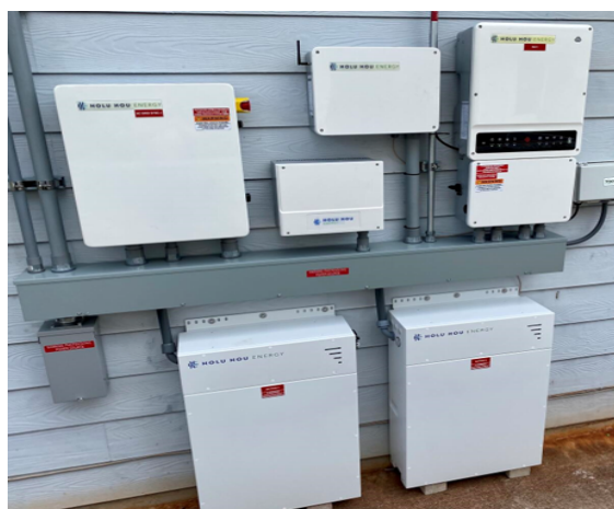
A HoluPower xP system consisting of 9.6kW of AC power with 16.4kWh of energy storage.

In comparison to its industry counterparts, the Company appears significantly undervalued on revenue basis. Aligning the valuation of BRQS' legacy business with a price-to-revenue multiple of 1.0, based on net revenues and outstanding shares reported for the year ended on December 31, 2022 in the latest 20-F form filed in May 2023 would translate to a market capitalization of $52.5 million, or about $3.31 per share.