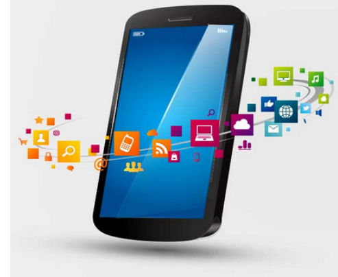
Borqs is leading 5G and smart-phone technology.

It also holds a significant share of the single-family residential market and is also well known for commercial installations in Hawaii. In the pipeline are thousands of units of multiple dwellings residential solar+storage systems throughout California and Hawaii.