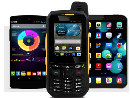
Mobile devices embedded with Borqs software