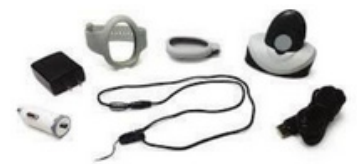
Wearable Health Solutions Products