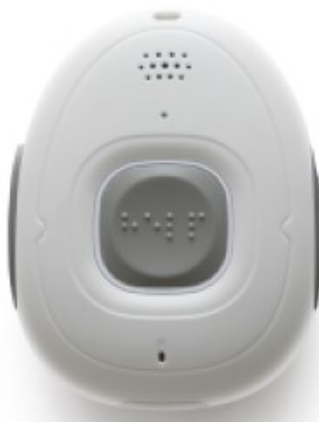
4G iHelp MAX™

technology developer focused on mobile alert and tracking devices for emergency medical and occupational safety markets worldwide. WHSI has advanced into a healthcare technology space, focusing on not only mobile alert and tracking devices, but on telehealth and remote patient monitoring, electronic and telecommunications technologies and services used to provide health-related care and services from anywhere. This is on the forefront due to the pandemic. The Company is currently preparing to launch its next-generation state-of-the-art iHelp MAX, a telehealth-ready